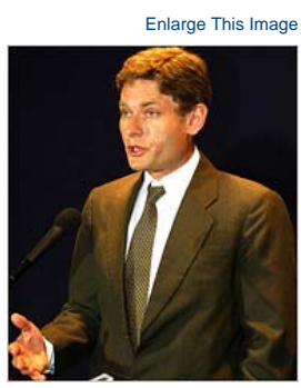
Enlarge This Image