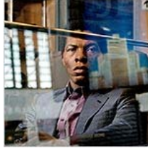
Mystery Man on a Mission in Spain