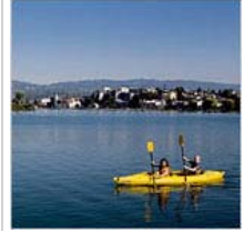
36 Hours in Oakland, Calif.