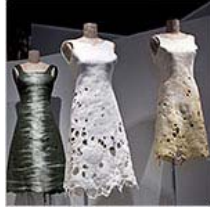
Humble Fabric Takes Center Stage