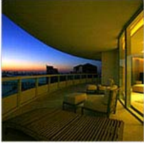
Miami Beach Condos Dodge a Cold Front