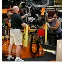
Auto Assembly Lines, and American Power